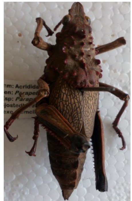
C. Parapetasia rammei