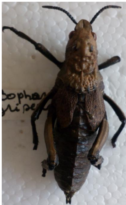
B. Dictyophorus griseus