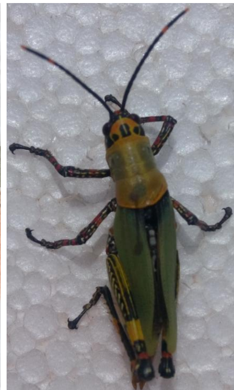
F. Zonocerus variegatus .