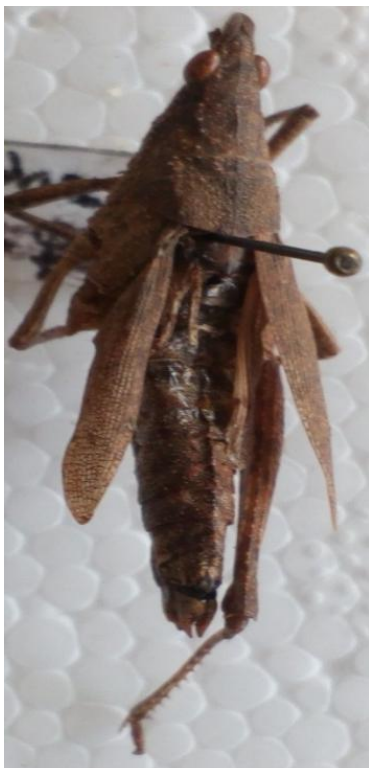
D. Pyrgomorpha vignaudii