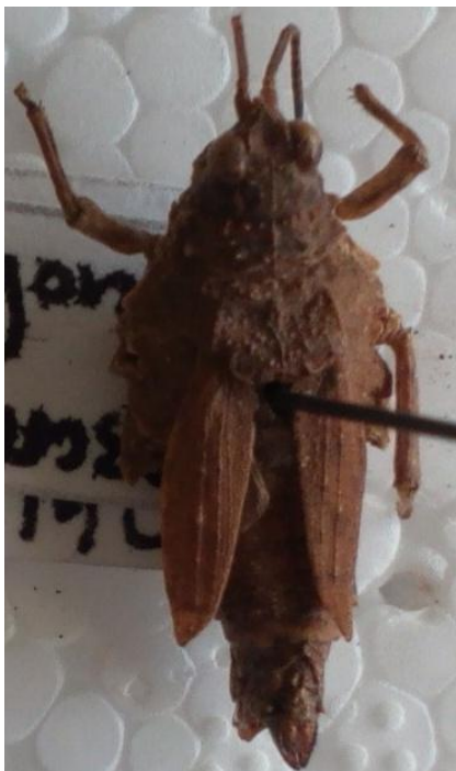
A. Chrotogonus senegalensis