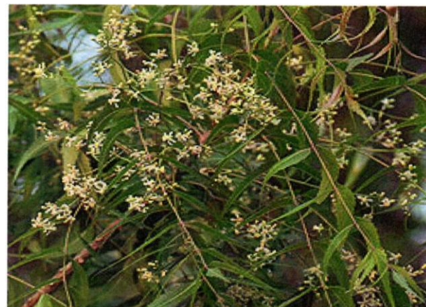
Figure 2. Leaves of neem tree.