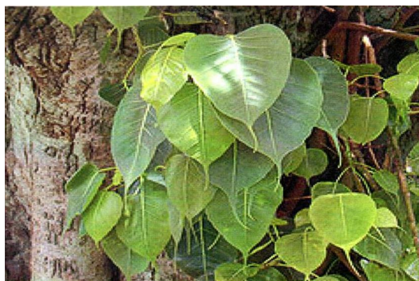
Figure 1. Leaves of Ficus religiosa .

The study involves a site contaminated with tannery effluent of Gundur near Bharathidasan University, Tiruchirappalli. The soil in the study site has been prone to effluent contamination over a period of 10 years. The plants Ficus religiosa (Figure 1), neem tree (Figure 2) and five-leaved tree (Figure 3), around the study area within a radius about 100 meters are collected. Control samples were also collected for analysis. It is then transported to the laboratory to carry out further analysis.