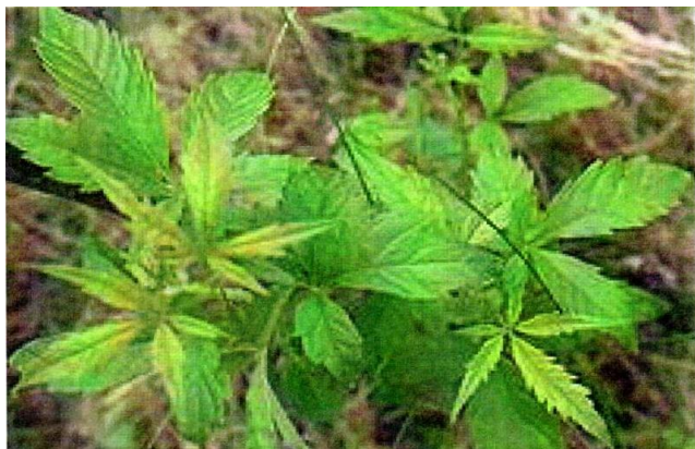
Figure 3. Leaves of five-leaved chaste tree.