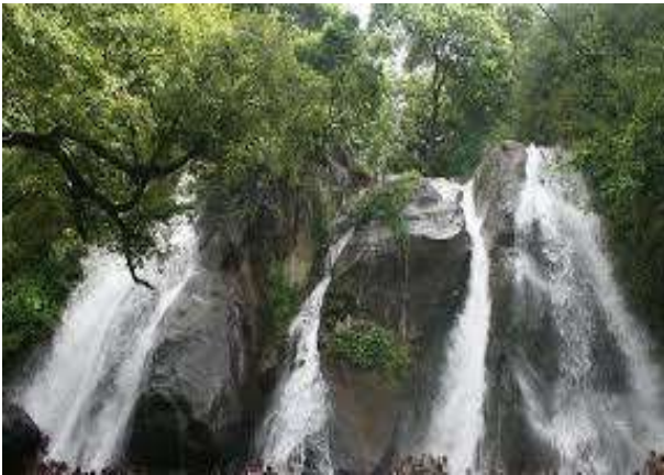
Figure 2. A view of locality, five falls in Coutrallam, Tenkasi District, Tamilnadu.