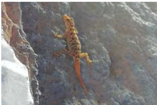
Figure 4. Cnemaspis agarwali species