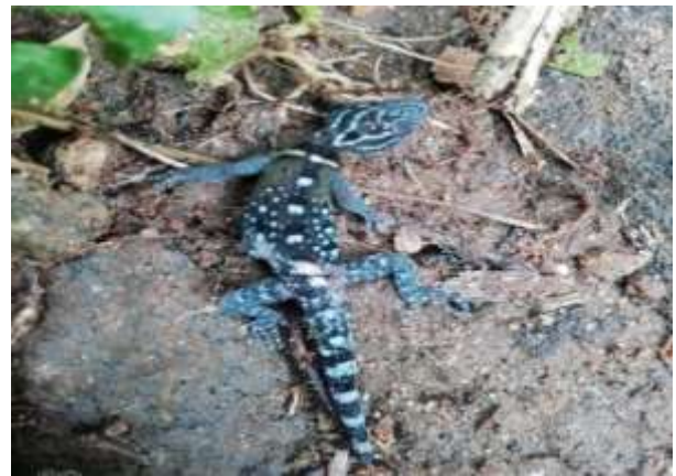
Figure 3. Cnemaspis ornate species.