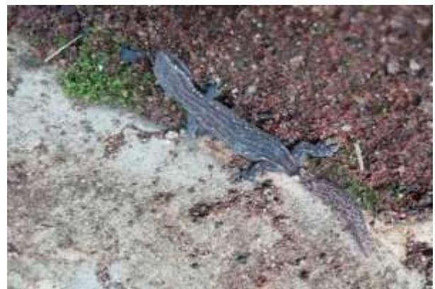
Figure 5. Hemiphyllodactylus nilgiriensis male species.