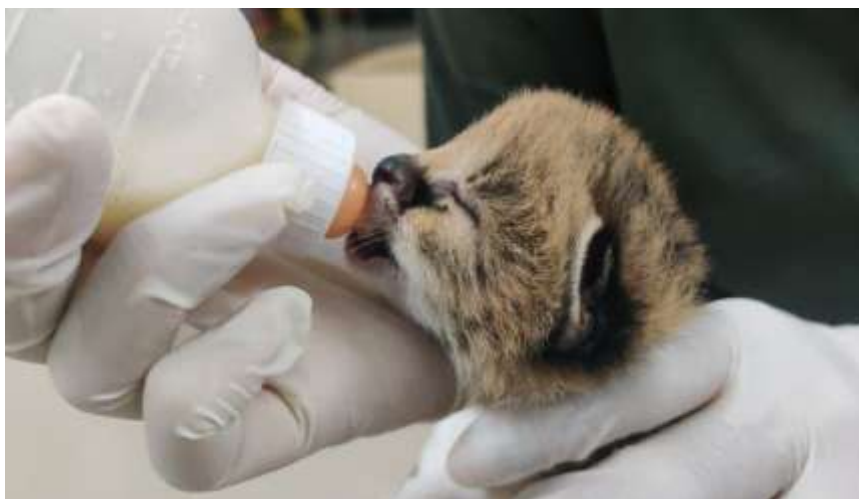
Figure 1. Feeding position of closed eye kitten (age of 4th day).

On the first day we provide electrolyte for the first 24h. After that on second day we started feeding the kitten with Lactol Kitten milk (LKM). The feeding bottle and nipple size plays a vital role according to the animal size, so we choose the Lactol feeding set (25 ml bottle with four tits and washing brush). The neonate was kept on its stomach with head slightly elevated to feed from tilt bottle, so that there is always milk in the nipple. We allowed the kitten to push and knead on smooth towel with its front side of body while sucking (Figure 1). After waking up from the sleep, the kitten has a strong sucking action. According to the guideline by Andrews (2020), in the first week 35-45 ml LMK feed was given every 3h and six times per day (6-7 ml each time) with a night sleep break time of 4-6 h. follow the (Table 1) for further feedings.