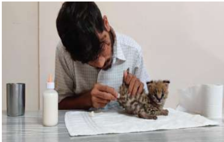
Figure 2. To cleaning ano-genital area by warm moist cotton ball.