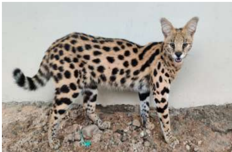
Figure 3. Successfully hand-rearing of serval cat Leptailurus serval (age of 240 day).